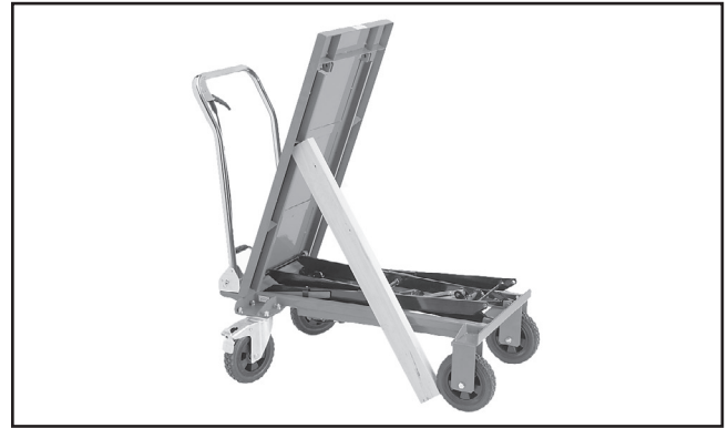
Figure 7. Supporting table with a 2x4.

If you need help with your new hydraulic lift table, call our Tech Support at: (570) 546-9663.